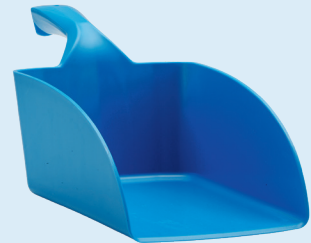
Hand Scoop (2 ltr) - 5670x