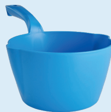
Round Bowl Scoop (2 ltr) - 5682x