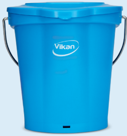
6 Litre Bucket - 5688x Lid for 6 Litre - 5689x