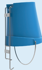
Wall bracket - 16200 Fits both 6, 12 and 20 Litre Bucket