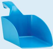
Hand Scoop (0,5 ltr) - 5677x