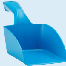
Hand Scoop (1 ltr) - 5675x