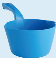
Round Bowl Scoop (1 ltr) - 5681x