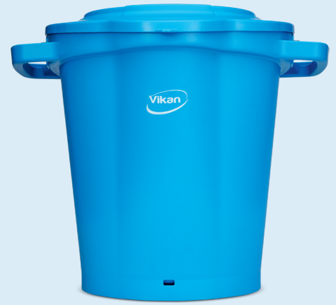
20 Litre Bucket - 5692x Lid for 20 Litre - 5693x