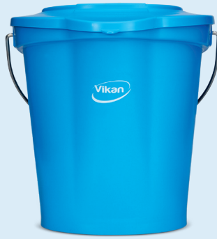
12 Litre Bucket - 5686x Lid for 12 Litre - 5687x